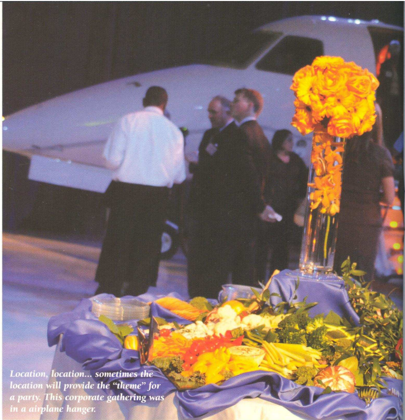
Location, location... sometimes the location will provide the “theme” for a party. This corporate gathering was in a airplane hanger.

A. The ideas here are endless, and can only be limited by your imagination. I have done so many themes: Winter Wonderlands, A Boop Boopy Birthday (Betty Boop theme),